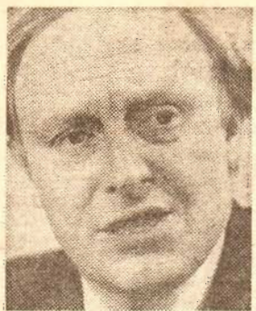
Kinnock . . . faces fury of the left-wingers

He said he expected Labour and the TUC to stick by conference deci-