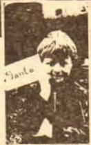
Strike boy's plea to