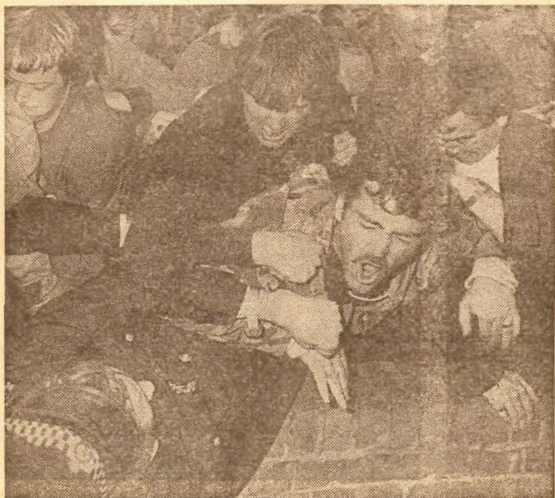
■ UNIVERSALLY abused by the pickets, universally applauded by a grateful public, policemen from all over Britain battled to maintain law and order against fearful odds. At Tilmanstone Colliery, Kent (above, left) last September 150 pickets tried