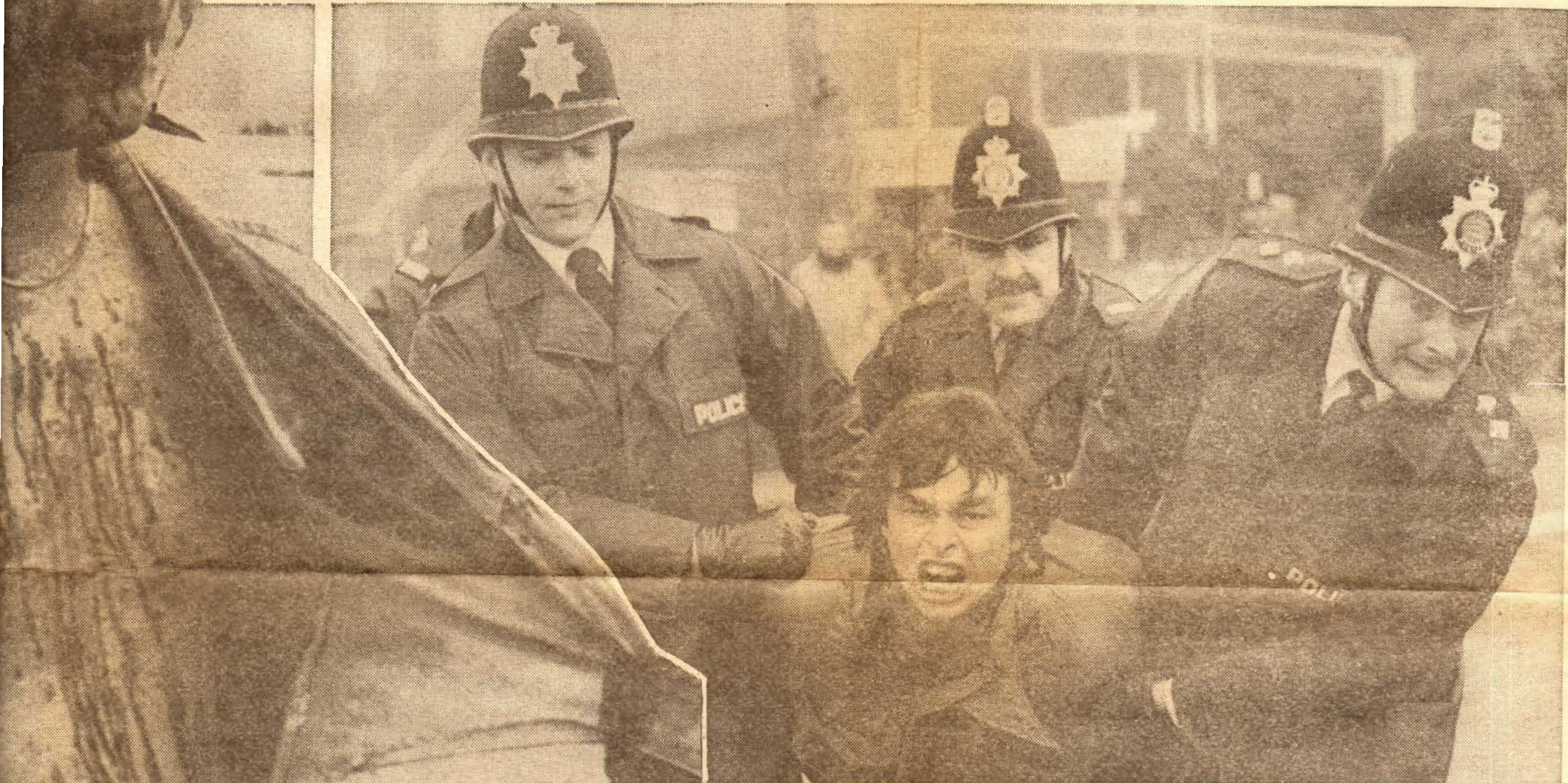
A SCREAMING picket, his face contorted with rage, is bundled away from a demonstration in May aimed at blocking the import of coal through Wivenhoe docks, in Essex. He was neither pitman nor docker. He was a student. Two attempts to start a dock strike in support of the miners flopped.

E bloodied face of conflict . . . an injured picket (above) stumbles blindly from the y at Orgreave, Yorks, where some of the worst rioting of the strike erupted. Among missiles thrown at police were these murderous nail bombs (far left). At the Battle Orgreave on June 18, 100 pickets were arrested and 80 people — including 28 icemen—were injured. On another occasion, police giving the kiss of life to two mpled miners were themselves stoned by the mob.